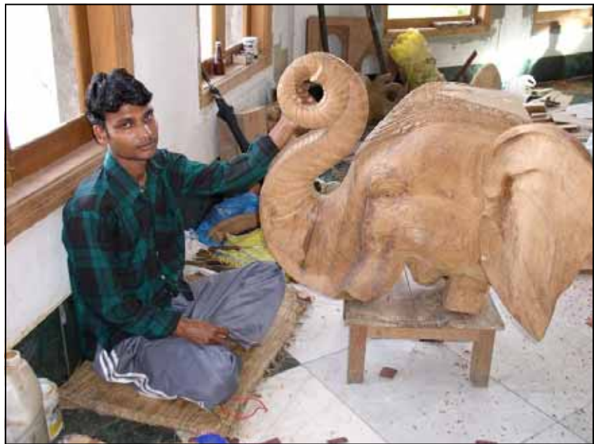
Wood columns and elephant heads for the kirtan hall