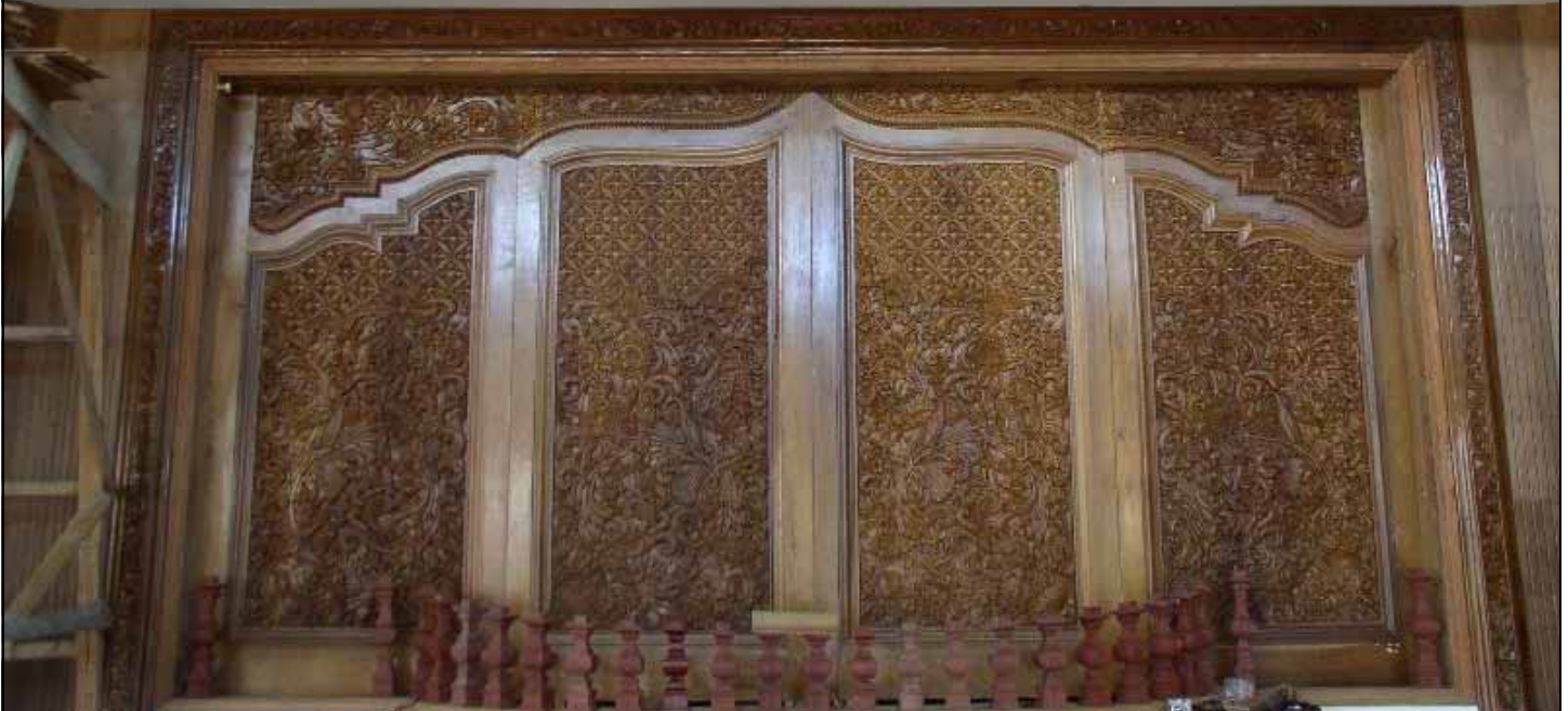
Altar doors and wooden panels placed temporarily in the temple room for the public to see on Janmastami day