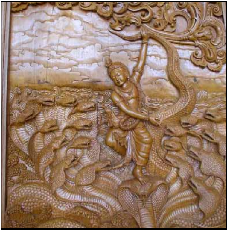
Kaliya Krishna detail on altar door