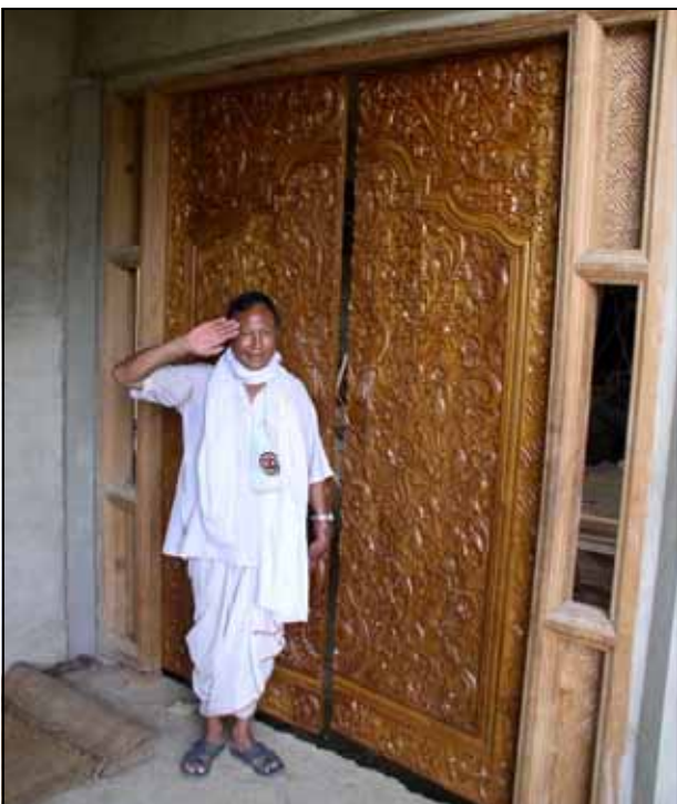
A devotee salute in front of the ground floor intricately carved doors